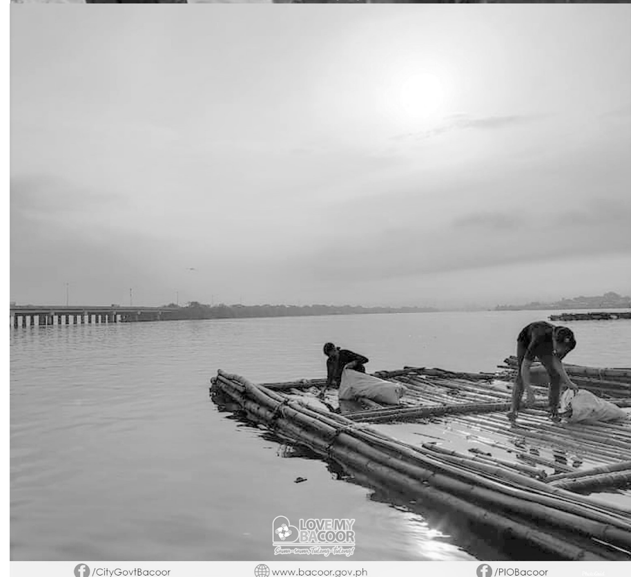
Facebook: /CityGovBacoor, Website: www.bacoor.gov.ph, Facebook: /PIOBacoor